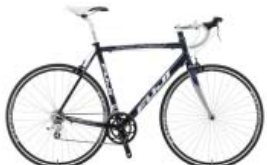
Fuji Roubaix 3.0 19lb. aluminum carbon road