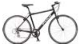
Fuji Absolute 3.0 easy to ride road bikes