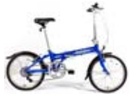
Breezer folding Zig7 high performance to go!