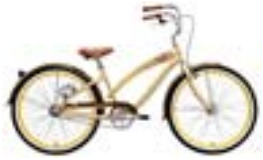
Nirve's 3-speed Automatic cruisers