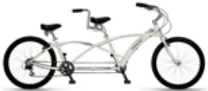
Phat Cycles stylin' Limo or Longboard