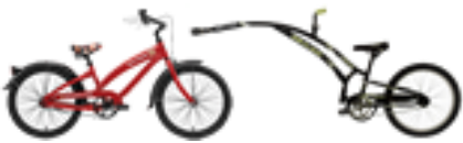
Kid's cruisers & Trail-abikes