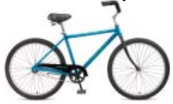
Fuji Cape May cruiser